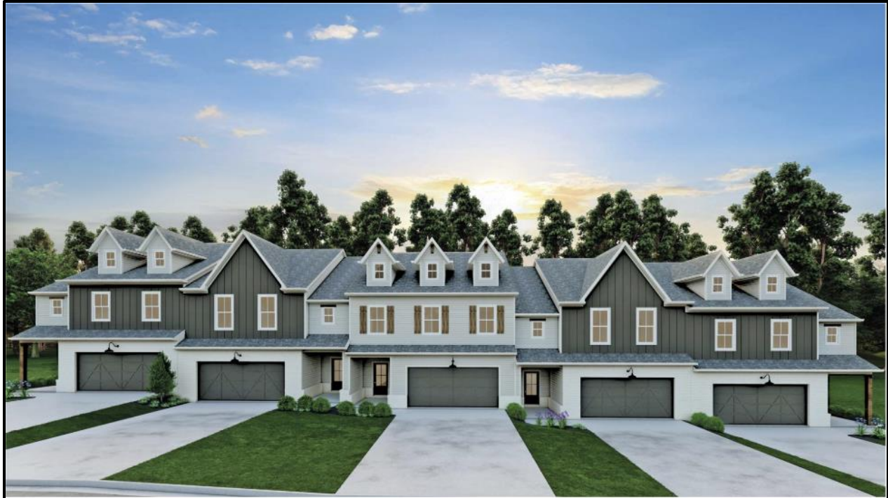
Existing Townhomes in Sharon Commons

Asking Price: $115,000 per lot Total: $2,645,000